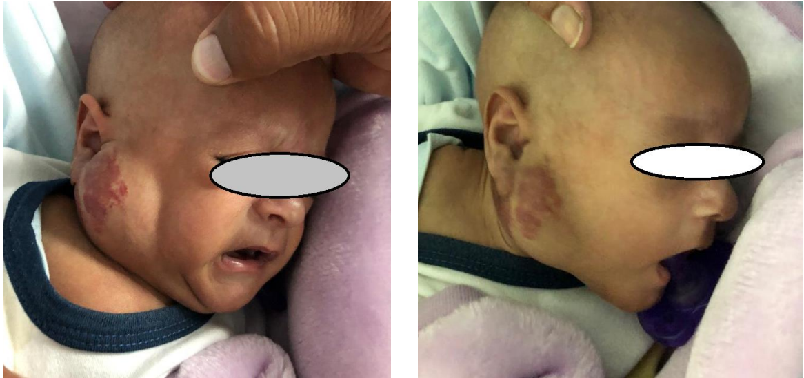
Figure 3& 4: Infantile haemangioma pre and post treatment